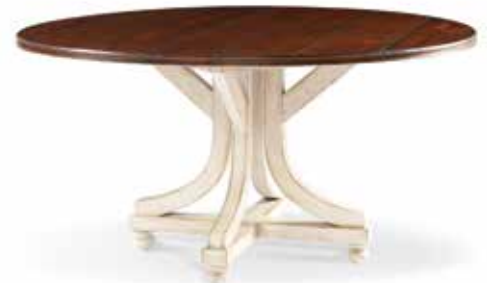
550-10-34 Leland Base ☑

Shown with GL-60" Glass Top with Beveled Edge