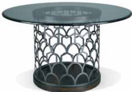
550-01S Tiburon Metal Round Dining Table Base - Slate

Shown in -34 Washed Linen finish; available in all finishes Shown with 552-03 60" Maple Top with Grooves