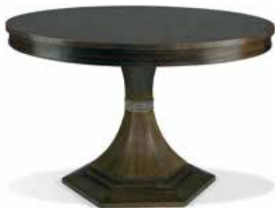
550-06-00 Paxton Base ☑

Shown in -B3 Chamois Sandblasted finish; available in all finishes Shown with 552-19 72" Ash Top with Apron