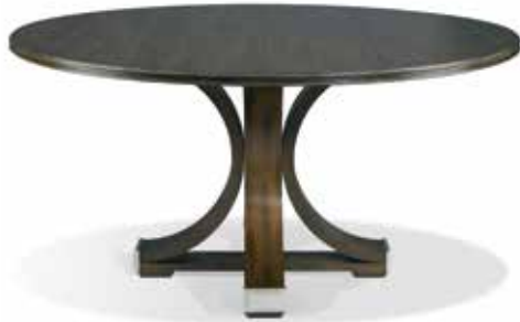
550-03-A1 Celia Pedestal Base ☑