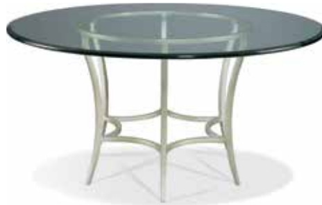
550-09 Sunburst Base

Base shown in -A1 Modern Walnut finish with Pewter striping; Base available in all finishes Shown with 552-14-A1 60" Walnut Top with Apron. Top shown in -A1 Modern Walnut finish