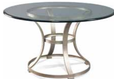
550-11 Everett Dining Table Base