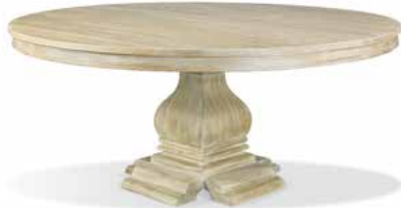
550-05-B3 Baluster Base ☑

Nickel hardware standard, Antique Brass hardware optional Shown in -A1 Modern Walnut finish; available in all finishes Shown with 552-03 60" Maple Top with Grooves